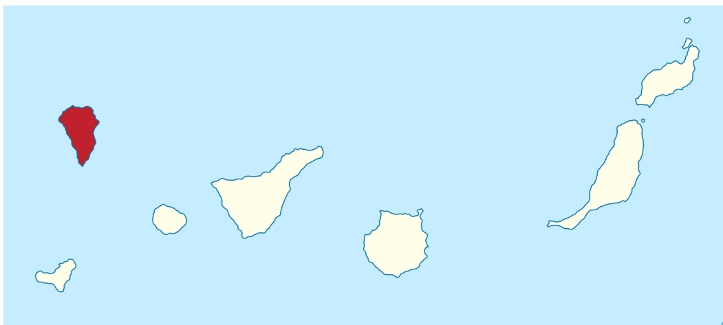
Figure 1: Map of La Palma in the Canary Islands.

19 La Palma is one of the west most islands in the Volcanic Archipelago of the Canary 20 Islands, a Spanish territory situated in the Atlantic Ocean where at their closest 21 point are 100km from the African coast Figure 1. The island is one of the youngest, 22 remains active and is still in the island forming stage.